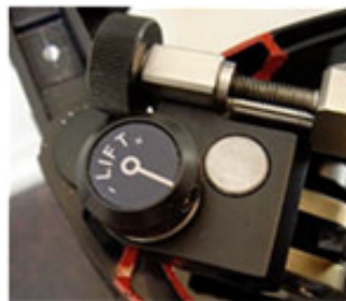
Lift knob with Rate knob behind